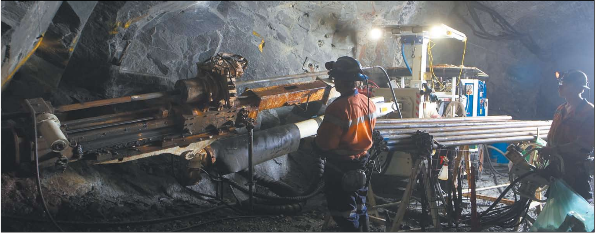
Silver Lake's underground mining at Daisy Milano Mine