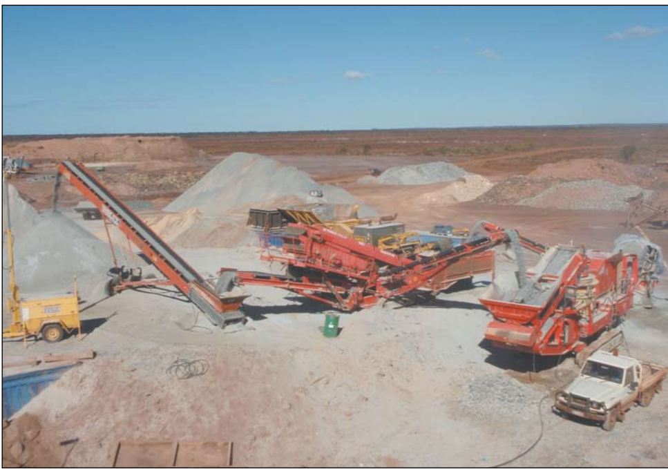
OPS machinery Finlay 683 and CR300 Cone Crusher at work at Daisy Milano in the feeding, crushing and stockpiling process

The recruitment specialist is dedicated to zero harm and has AS/NZS 4801 Occupational and Safety Management System accreditation.